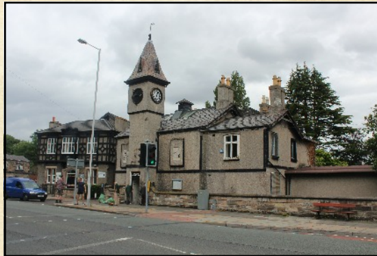
Lower Bebington - Mayer Hall