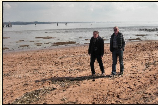
Rock Park - the beach