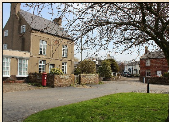
Frankby - The Nook

† Trees - Trees play a hugely important part in many of our Conservation Areas so we are delighted to support Wirral's very lively 'Wirral initiative on Trees' group. They have worked with the Council to produce a much needed Council Policy on trees and we look forward to its implementation.